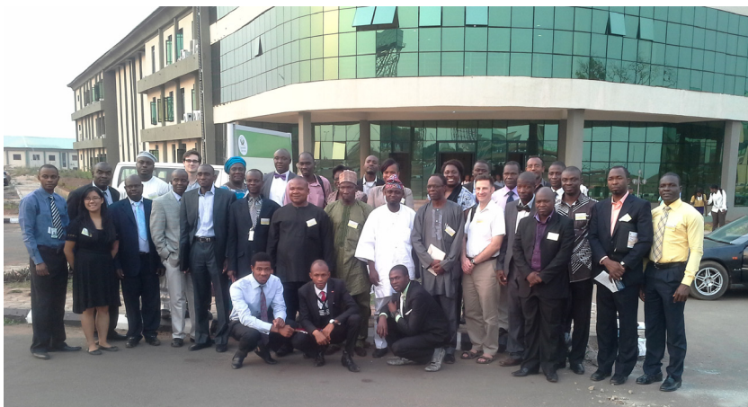
Picture from the international conference on “Africa State Legislatures” in Nigeria.