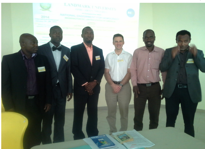
Picture from the international conference on “Africa State Legislatures” in Nigeria.